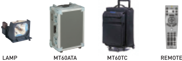
LAMP MT60ATA MT60TC REMOTE