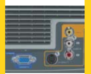
Easy to use, easy to set up.