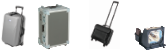
VT65ROLLER VT60ATAPRO LEATHERROLLER LAMP