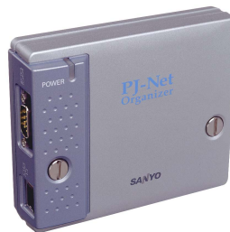
Optional PJ-Net Organizer Model# POA-PN40