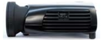
iVision 30 3D side panel