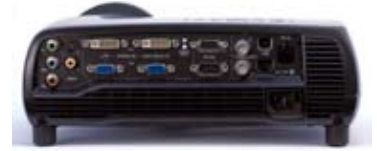
iVision 30 3D back panel