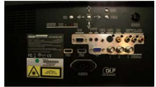
M-Vision LED back panel