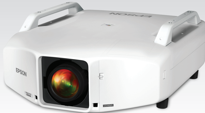
Projector shown with lens. Lens sold separately.