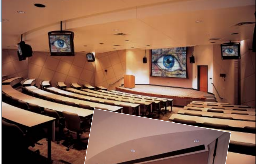
The Marten House—Hotel and Lilly Conference Center, Indianapolis, IN. Dealer: Electrical Systems Co.