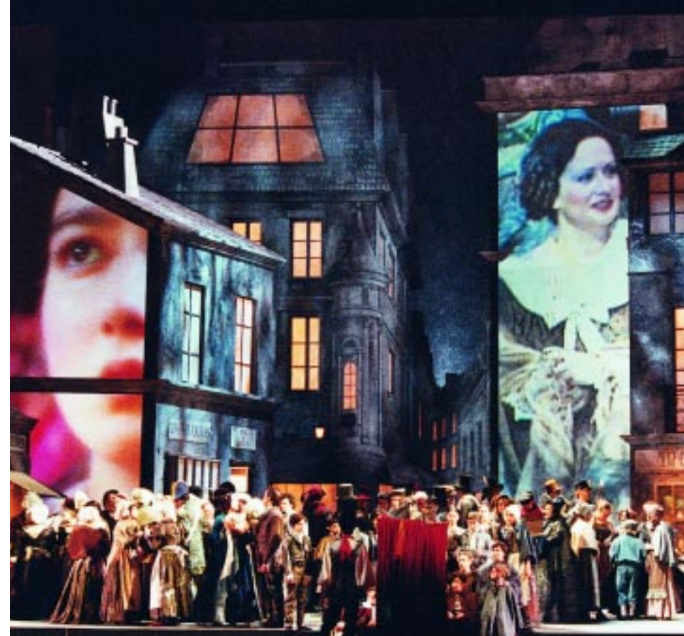
"La Bohème", - Italy

The Roadster X4 takes the strain out of your events too. Built-in stackability, lens bayonet style insertion (for a full suite of fixed and zoom lenses) are some of the many benefits of a system that weighs in at just 39.9 kilos.