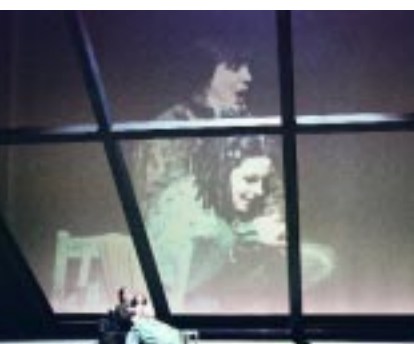
"La Bohème", - Italy

Everyone knows good things come in small packages, but did you know the Roadster X4 has everything you need for rental staging applications. Crammed full of features normally reserved for top of the line projection systems, the Roadster X4 is driven by the very latest in 3 chip DLP™ technology and is able to display from the widest range of sources with digitally perfect projection.