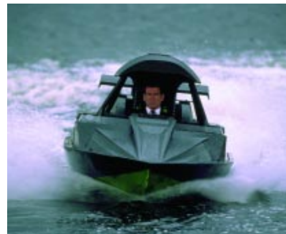
"The World Is Not Enough", EON Productions - Pinewood, UK