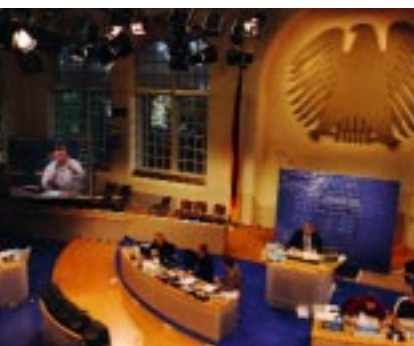
ARD German Election Coverage, - Germany