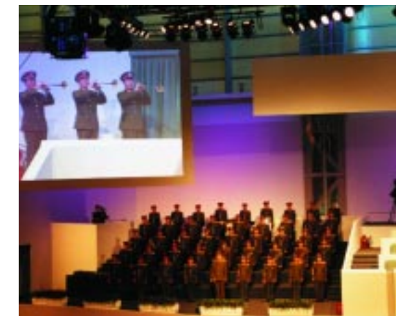
Macau handover - China

Roadster The World's 1 st purpose-built projectors for Rental Staging