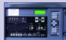
Rear view of Roadster X4 showing LCD display panel and inset keypad