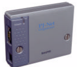
Optional PJ-Net Organizer Model# POA-PN01