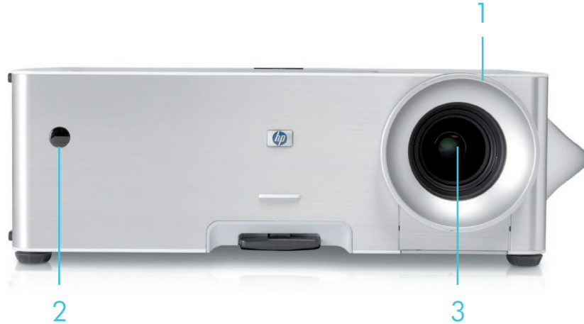
HP Digital Projector xp8010 shown