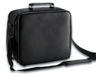
Carrying case L1674A

Easily connect to a wide range of video equipment, from a VCR to a camcorder.