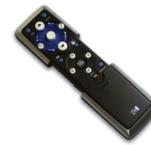
Premium wireless remote control with USB L1631A

The lightweight and sturdy design allows you to take it wherever you need to present.