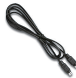
6-foot S-video cable L1635A

Lightweight and easy to carry with a built-in handle, this mobile screen sets up easily anywhere you need it.