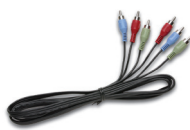
HDTV component cable (RGB) L1634A

Always have a back-up lamp module for your presentations.