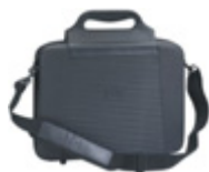
HP carry case

This case projects a polished image and keeps your projector and accessories together and safe.