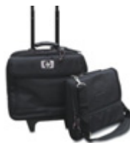
HP deluxe combo case

Superior durability without the bulk, this easy-to-carry case makes transporting and organizing your HP digital projector and accessories a breeze.