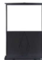
HP mobile 60-inch screen L1633A

You're sure to present with confidence and ease with this HP remote control with simple controls and a laser pointer.