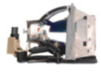
HP lamp module

Give your audience the big picture whenever and wherever you want with a self-contained, easy-to-use mobile screen.