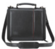
HP leather carrying case