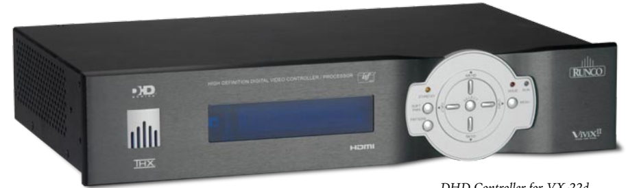
DHD Controller for VX-22d

The Video Xtreme Portfolio projection systems include the DHD controller/processor. The DHD is engineered with advanced, Vivix II™ digital video processing to produce stunning video imagery, even elevating standard NTSC material to near high definition levels. Superb scaling capabilities output all signals at the native display resolution of the projectors.