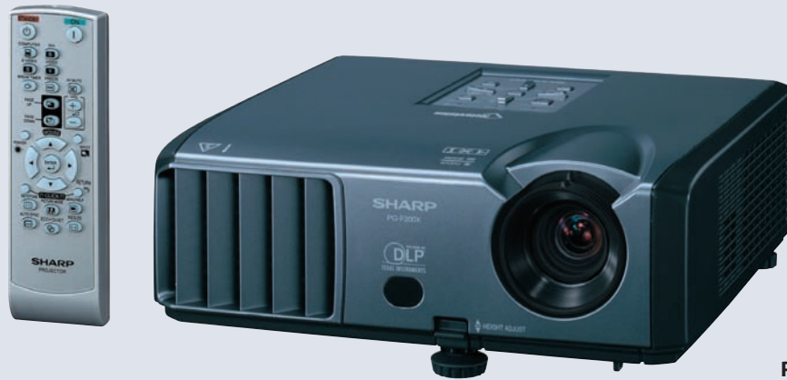
PG-F200X: 2100 ANSI LUMENS