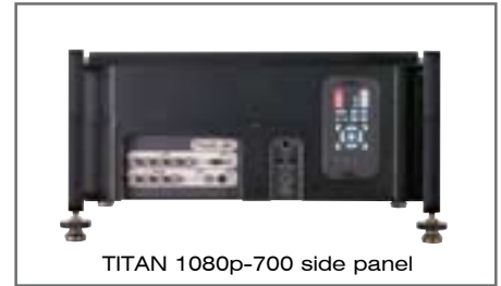
TITAN 1080p-700 side panel