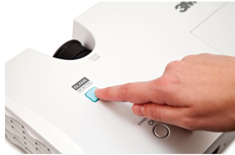
With 'My Button' the presenter can instantly blank the screen

Adjustable height extension 78-6969-9698-8