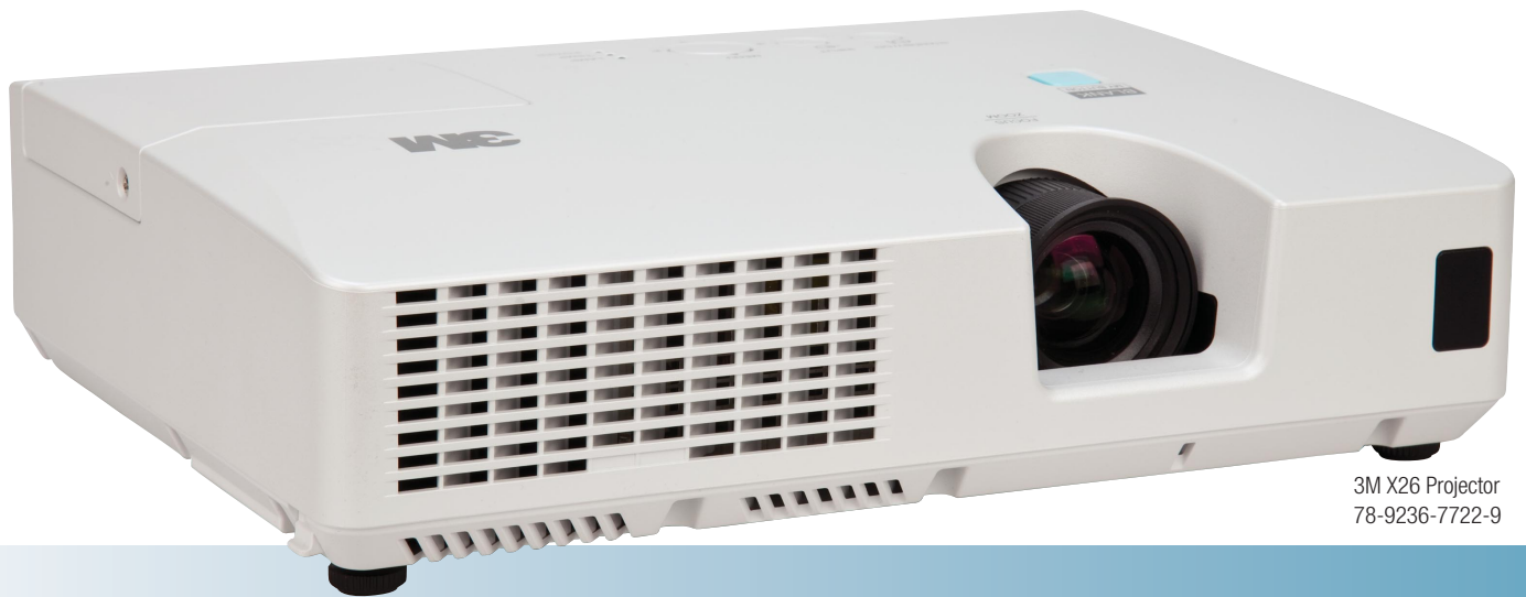
3M X26 Projector 78-9236-7722-9

In the classroom the X26 model offers White, Green and Blackboard modes. With built-in image templates the user can also project useful guides onto the screen for assisting annotation. Other cost-saving features that make the X26 not only the ideal education projector but also a highly efficient business tool include Hybrid filters for 5,000 hour maintenance intervals; less than 1 watt stand-by power consumption; and 'Auto-eco' Mode for cost efficiency management.