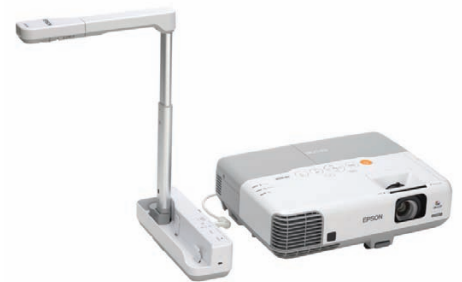
Share 3D objects using the ELP-DC06 document camera