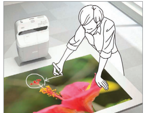
Project onto any horizontal surface such as a tabletop