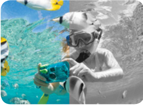
Precise and flexible color control.

Project images and grids brilliantly onto virtually any surface.