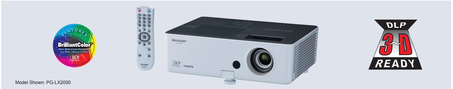
Model Shown: PG-LX2000

Portable and affordable, these 3D Ready BrilliantColor™ DLP® projectors deliver high image quality and superb reliability for classroom, meeting room and small office use. With 2,800 lumens and 2,000:1 contrast ratio, these models provide exceptionally vibrant and realistic image reproduction. The sealed DLP chip with filter-free design helps ensure low maintenance and operating costs. Built in an ISO 14001 certified factory with standby power consumption as low as 0.5W and estimated lamp life of up to 5,000 hours (in eco mode), these lightweight RoHS compatible projectors are an environmentally conscious choice.