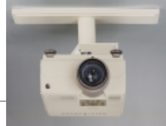
SHOWN WITH OPTIONAL CEILING MOUNTING BRACKET (AN-CM230)